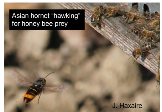
Asian hornet "hawking" for honey bee prey

Asian Hornet abdomen is almost entirely dark except for 4th abdominal segment.